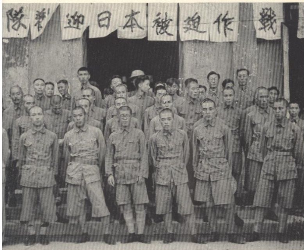
Japanese as well as Koreans are included in this Korean Volunteer Corps, photographed at Kweilin, China, where they are fighting the invaders. The Japanese are captives converted by the Koreans. Units such as these make up the great revolutionary movement of which Kim San is one of the chief younger leaders. Kim himself cannot allow his picture to be taken. The banners at the top of the picture read, "Korean Volunteer Corps welcomes the Japanese captives."