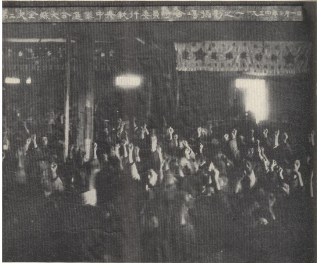
Another rare photograph, originally printed at Juikin on blueprint paper, showing members of the Soviet Central Executive Committee giving the Red salute on February 1, 1934. It was then that the Soviets decided to evacuate the southern provinces and march to the northwest.